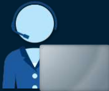
SAS Studio (browser)

When you use SAS Studio, you are using SAS software behind the scenes. SAS Studio uses a web browser to connect to SAS on your local computer, or it can connect to SAS on a server.